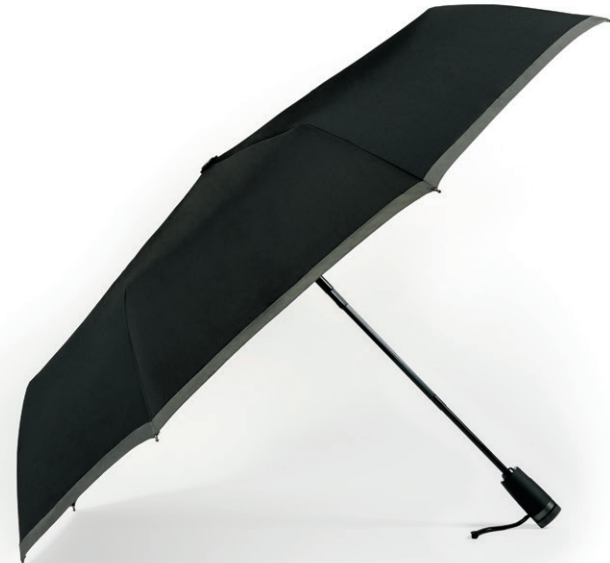
HUF007A - GEAR Pocket umbrella black