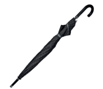
HUN310J Dia. 1140 / L. 930 mm