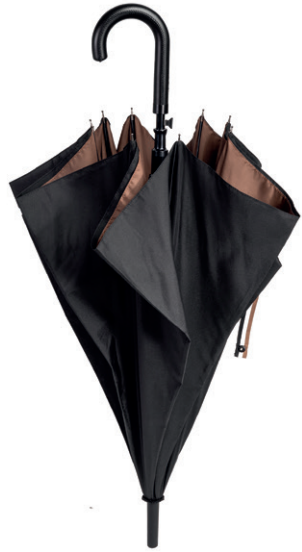
HUN321A - Iconic City umbrella black