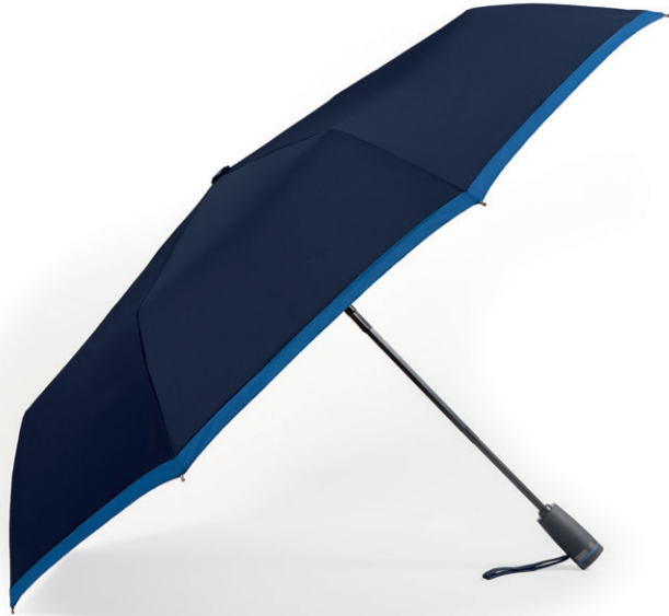
HUF007L - GEAR Pocket umbrella blue