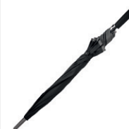
HUN007A Dia. 1160 / L. 915 mm