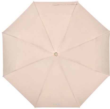
HUG311X - Triga Pocket umbrella nude