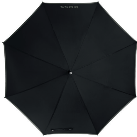
HUN007A - GEAR City umbrella black