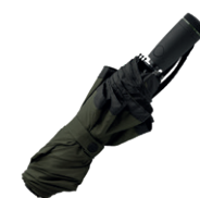
HUF007T Dia. 1050 / L. 320 mm