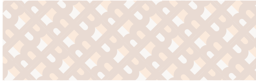
HUF310X - Monogram Pocket umbrella nude