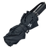
HUF304A Dia. 1050 / L. 325 mm