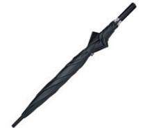
HUG304A Dia. 1300 / L. 1000 mm