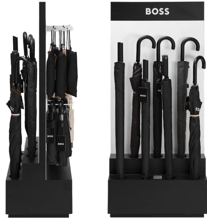
Umbrella display – HZV024