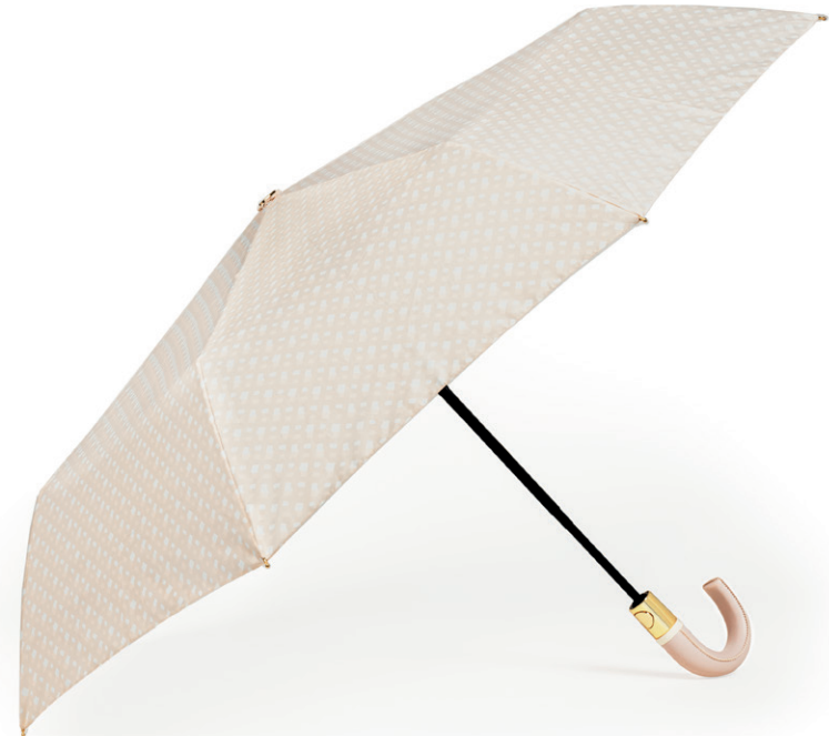
HUF310X - Monogram Pocket umbrella nude