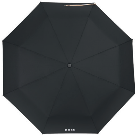
HUG321A - Iconic Mini umbrella black