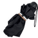
HUG321A Dia. 960 / L. 240 mm