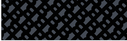
HUF310J - Monogram Pocket umbrella dark grey