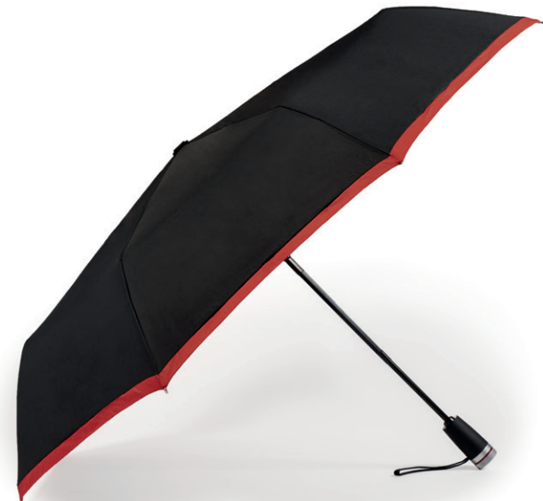
HUF007P - GEAR Pocket umbrella red