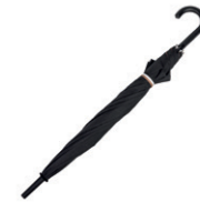
HUN321A Dia. 1130 / L. 910 mm