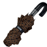
HUF310Y Dia. 1030 / L. 358 mm