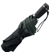
HUF007A Dia. 1050 / L. 320 mm