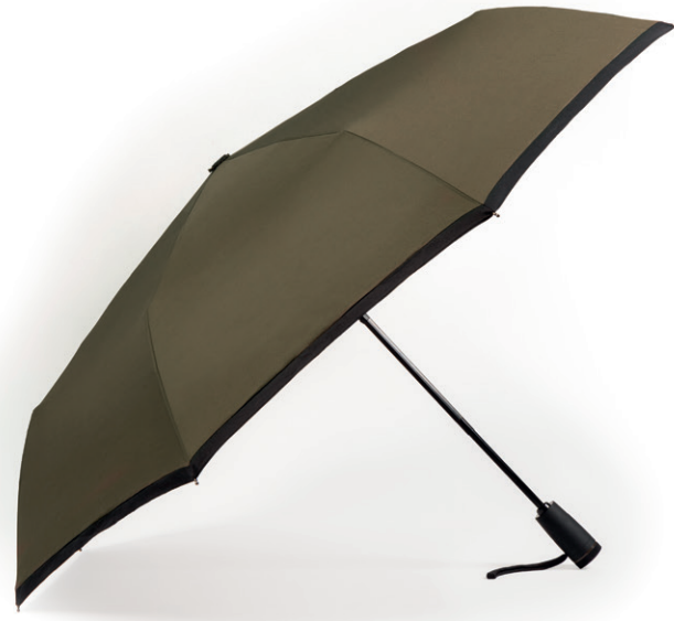
HUF007T - GEAR Pocket umbrella khaki