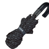
HUF310J Dia. 1030 / L. 358 mm