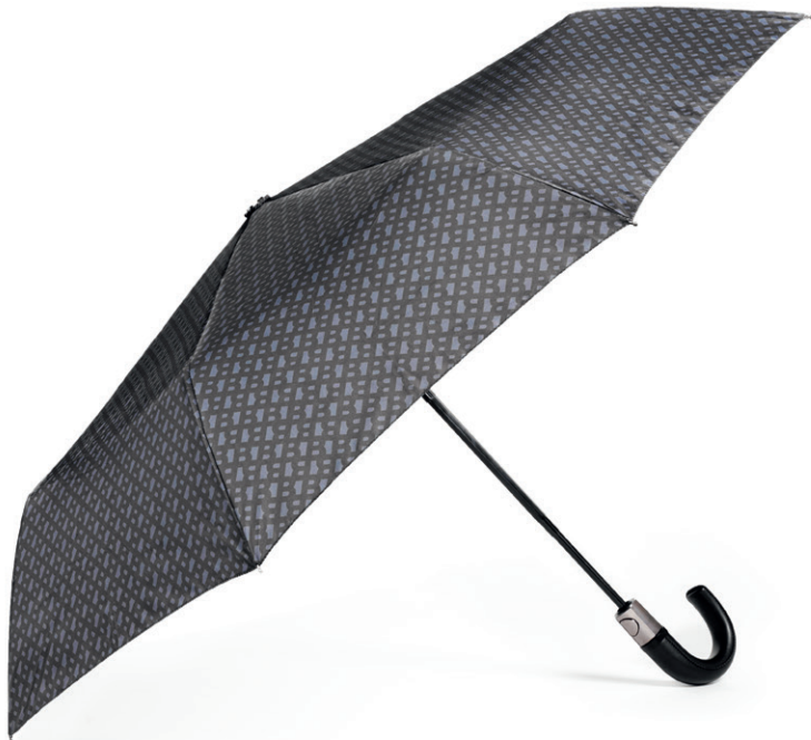
HUF310J - Monogram Pocket umbrella dark grey