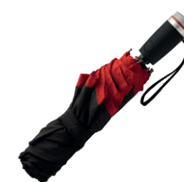
HUF007P Dia. 1050 / L. 320 mm