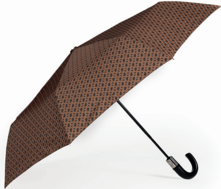
HUF310Y - Monogram Pocket umbrella camel