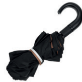
HUF321A Dia. 1020 / L. 355 mm