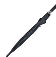
HUN304A Dia. 1130 / L. 885 mm