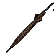
HUN310Y Dia. 1140 / L. 930 mm