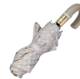
HUF310X Dia. 1030 / L. 358 mm