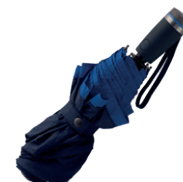
HUF007L Dia. 1050 / L. 320 mm